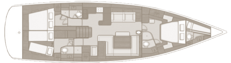
1 Forward cabin - 1 Head version, 2 Aft cabins 2 head compartments + Forepeak cabin (optional)